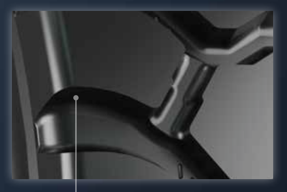
+10% vs Premium Competitor

The deeper tread provides longer tire life and boosts the efficiency of your machine. The casing can also be retreaded, maximizing your investment in a sustainable way.