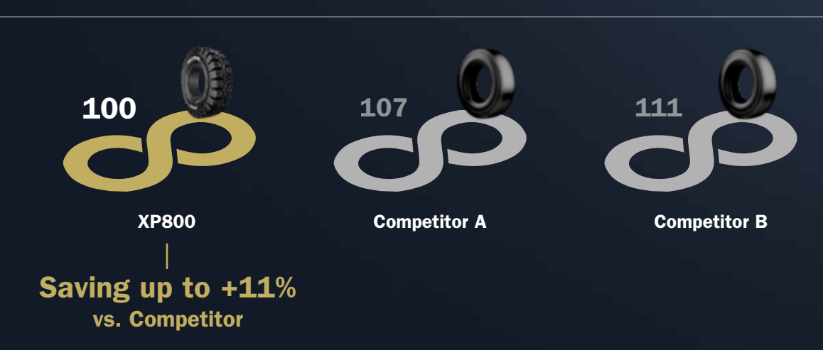
Cost per hour - Index Lower is better

The chart shows that XP800 guarantees the best cost of ownership in a medium intensity application scenario, potentially saving up to +11% compared to our competitors.