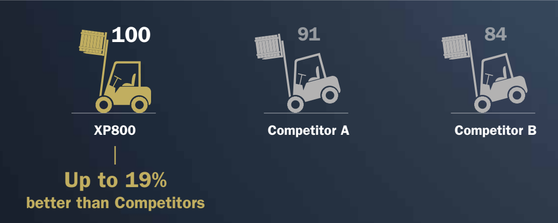
Stability - Index Higher is better

Due to the extra wide tire width, the XP800 offers exceptional stability both during the ride and while handling heavy loads.