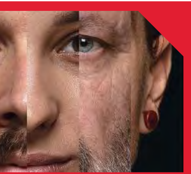
DIVERSITY AND INCLUSION